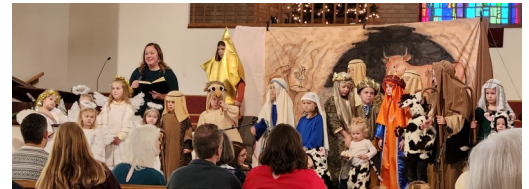
IotlaKids Christmas Program

There are already plans on the calendar for the new year, with more in the planning stages. Please remember that there will be a meeting for all parents/guardians of our youth on Wednesday, January 10th in the Youth Room. This will be held during the evening meal time, please feel free to bring